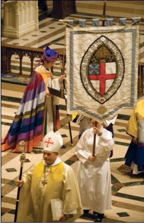
Jefferts-Schori, wearing multicolored vestments, is installed as Presiding Bishop in the National Cathedral in Washington