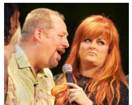
Rick Warren sings with Winona Judd during his recent AIDS conference

The soundtrack uses several pieces of music, including John Lennon's original recording of Imagine . The lyrics say: “Imagine there's no heaven/ It's easy if you try/ No hell below us/ Above us only sky.” There is no separation from the world at Saddleback Church. Practically any sorry piece of rock or rap music is fine as long as it is accompanied by a thin veneer of religiosity. Last week we reported in