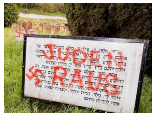
Graffiti reading “Jews out” and depicting a swastika are painted at the entrance of a Jewish Cemetary in France.

Friday Church News Notes, February 16, 2007, http://www.wayoflife.org Violence against Jews is on the rise in France. The following is excerpted from The Berean Call Daily for January 26: “In 2003 a poll found that 25% of Jews living in France were actively considering emigration, citing a growing Anti-Semitism as their motive. Consider the following recent comments from a Jew living in France. 'In Lyon, a car was rammed into a synagogue and set on fire. In Montpellier, the Jewish religious center was firebombed; so were synagogues in Strasbourg and Marseilles; so was a Jewish school in Creteil--all recently. A Jewish sports club in Toulouse was attacked with Molotov cocktails, and on the statue of Alfred Dreyfus in Paris the words 'Dirty Jew' were painted. In Bondy, 15 men beat up members