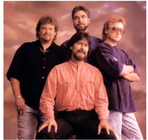
Alabama rose to prominence playing bars and nightclubs before recording their first big hit in the early 80s.

Friday Church News Notes, February 16, 2007, http://www.wayoflife.org The country music band Alabama is publishing its second “cross over” Christian album entitled “Songs of Inspiration II” in March. Alabama is one of the most popular country bands of all time, with 32 No. 1 Billboard singles. In 1999 it was recognized as the “Country Group of the 20th Century” by the Recording Industry Association of America. As we have documented many times, country music today is morally filthy, and Alabama's music is no exception. Consider, for example, the lyrics to their song “Feels So Right” -- “Lying here beside you, I hear the echos of your sighs./ Promise me you'll stay with me and keep me warm tonight./ ... Mmmm, Mmmm, feels so right. Feels so right.” We could give other examples of the lascivious nature of Alabama's music, which has helped corrupt the moral climate of this generation. It is confusion to think that one can sing acceptable praises to God while living in open defiance to God's Word. No amount of sincerity and emotional earnestness and talk of “grace” can make up for a lack of repentance and the absence of the fear of God. “For ye were sometimes darkness, but now are ye light in the Lord: walk as children of light: (For the fruit of the Spirit is in all goodness and righteousness and truth;) Proving what is acceptable unto the Lord. And have no fellowship with the unfruitful works of darkness, but rather reprove them” (Ephesians 5:8-11).