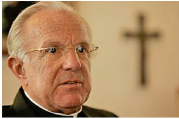
San Diego Bishop Robert Brom

The Roman Catholic diocese of San Diego, California, filed for bankruptcy protection from the 150 sexual abuse lawsuits that have been filed against it. Previous bankruptcy filings were made by the Catholic diocese of