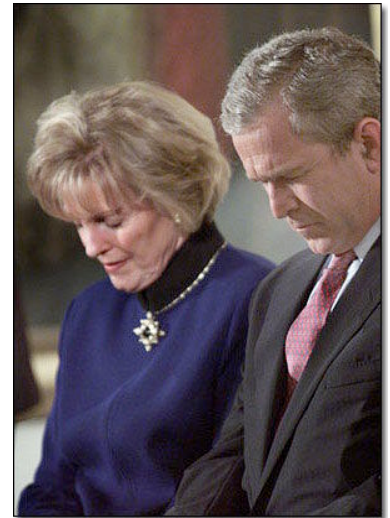
Shirley Dobson and President Bush

Shirley Dobson is the wife of influential Christian psychologist James Dobson, founder of Focus on the Family, who is an ecumenist in his own right. The November 1989 issue of Focus on the Family's Clubhouse magazine praised Mother Teresa and the readers were not told that this Catholic nun preached Rome's false sacramental gospel and gave multitudes a false comfort by encouraging them to place their faith in such vanities as the Roman Catholic Mass, the Roman Catholic Mary, and even Hindu idols. The September 1990 issue of New Covenant , a Roman Catholic magazine, featured a smiling Dobson on the cover. In November 2000, Dobson participated in a conference in Rome hosted by the Pope's Pontifical Council for the Family. Dobson also met with Pope John Paul II. America desperately needs the prayers of the saints, but God's Word does not allow us to join hands with those who hold false doctrine for the sake of any cause, be it ever so grandiose and right-sounding. “Now I beseech you, brethren, mark them which cause divisions and offences contrary to the doctrine which ye have learned; and avoid them” (Romans 16:17).