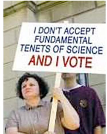
The Council of Europe fears people like this woman from England who are go against the prevailing wisdom in rejecting Darwinian evolution.