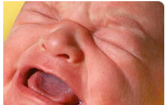
He could be lying