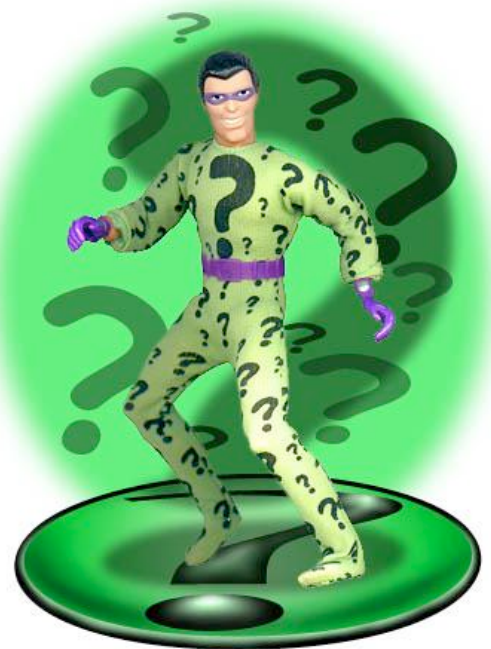
Mr. Science to the rescue....

A Reuters article on September 5 was titled “Distant Space Collision Meant Doom for Dinosaurs.” From the title one would assume that the article provides proof of such a thing, but there is no proof, only guessing. The article begins like this: “A collision 160 million years ago of two asteroids orbiting between Mars and Jupiter sent many big rock chunks hurtling toward Earth, including the one that zapped the dinosaurs, scientists said on Wednesday.” Again, we have what appears to be a statement of fact, but when we continue reading we find that the facts are non-existent. Consider the following key phrases: “... MANY SCIENTISTS BELIEVE ... The impact is THOUGHT TO HAVE triggered ... are THOUGHT TO BE leftovers ... along with PROBABLY Mars and Venus ... The collision is BELIEVED TO HAVE ... THOUGHT TO HAVE ... ESTIMATED ... PROBABILITY. ... IT’S HARD TO SAY.” Now there’s some solid science for you! In fact, the whole thing is based on computer simulations, and in a computer simulation of something allegedly occurring 165 million year ago, what you have is “garbage in garbage out.” And these people actually have the gall to mock Bible believers as unscientific.