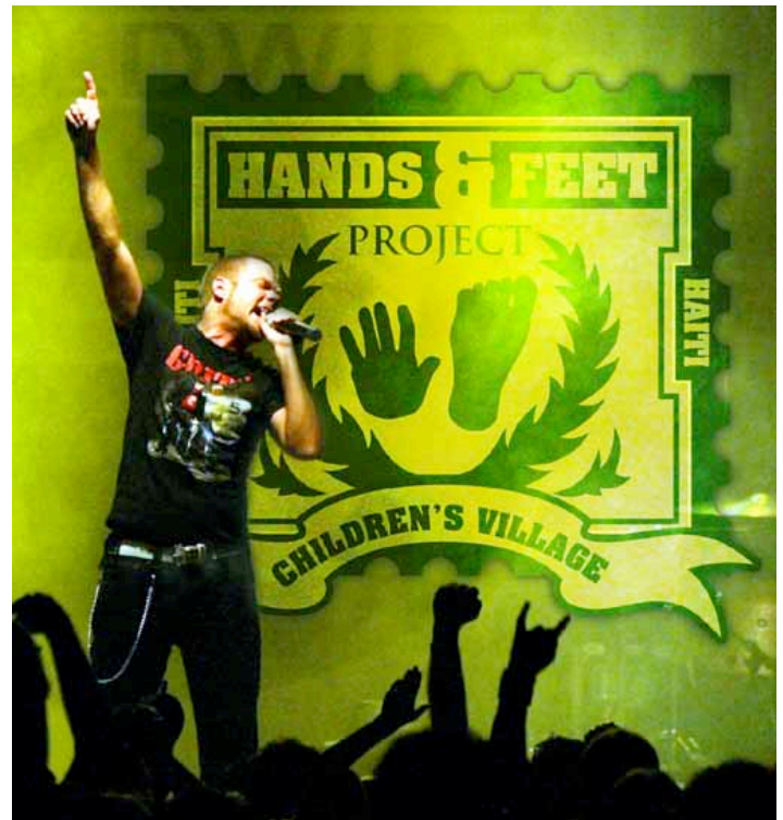
Christian rock band Audio Adrenaline