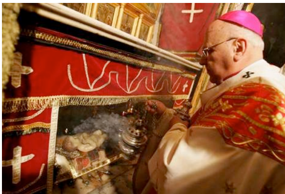
The Latin Patriarch of Jerusalem, Michel Sabbah, kneels in front of a statue of Baby Jesus after placing it in the grotto following the Catholic Christmas Midnight Mass at the Church of the Nativity compound in the West Bank town of Bethlehem.

concerned, but we must not deceive ourselves by thinking that Christmas is a biblical institution. It has far more to do with Romanism and paganism than biblicism. One thing wise Christians can do with Christmas is use it as an evangelistic opportunity. It is a great opportunity to explain who Jesus is and why He came.