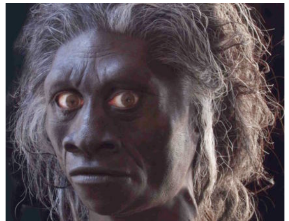
A model of what scientists now believe was a stunted human and not a missing link.

The remains of three-foot-tall people discovered four years ago in Indonesia are now believed by scientists to be "modern humans" with a growth disorder rather than a new species that lived 120,000 years ago. We have commented before that the remains were doubtless just "regular" humans and that there are pygmies and small types of people living today that are not considered a different species. I have met grown people in Nepal that are only about 4 feet tall. Now some scientists are suggesting that the remains are of people who had a growth disorder similar to microcephaly, a disorder that limits brain and body growth and that has been documented in about 100 cases worldwide. Adults with this disorder grow only to about 3 feet tall and their brains are comparable in size to that of a three-month-old baby, but their intelligence is not stunted and their bodies are proportioned normally ("Hobbits not a different species," London Telegraph , Jan. 3, 2008). Beware, friends, evolutionists "see" what they want to see. "For the invisible things of him from the creation of the world are clearly seen, being understood by the things that are made, even his eternal power and Godhead; so that they are without excuse: Because that, when they knew God, they glorified him not as God, neither were thankful; but became vain in their imaginations, and their foolish heart was darkened. Professing themselves to be wise, they became fools" (Romans 1:20-22).