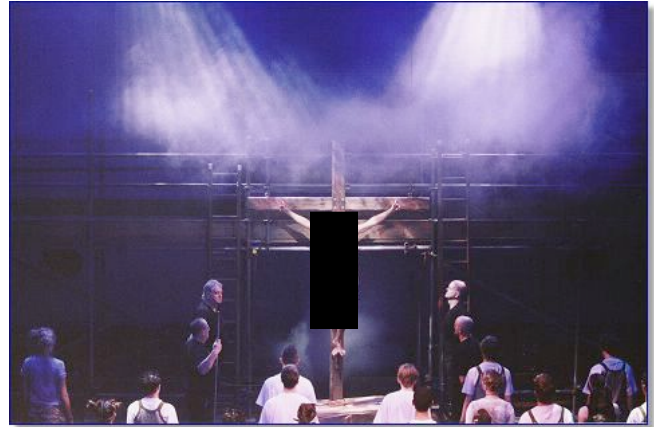
The crucifixion of a gay man that ends the play

The blasphemous play Corpus Christi , which depicts Jesus as a homosexual, is scheduled to open in Sydney, Australia, on February 7 as part of the city's annual Gay and Lesbian Mardi Gras festival. When the play ran in London, England, in 1999, it drew a death threat from an Islamic group. The author of the play, Terrence McNally, a homosexual, said he wrote it to show parallels between Christ's persecution and the rejection he faced as a homosexual growing up in Texas ("Gay Jesus Play Angers Australian Church Leaders," Reuters, Jan. 21, 2008). To the contrary, Jesus was persecuted because of holiness and truth, whereas a homosexual's "persecution" comes as a result of sin. Unrepentant sinners who are reproved often confuse it with persecution. The play's director, Leigh Romney, claims to be a Christian. The Bible warns: "This know also, that in the last days perilous times shall come. For men shall be lovers of their own selves, covetous, boasters, proud, blasphemers, disobedient to parents, unthankful, unholy, without natural affection, trucebreakers, false accusers, incontinent, fierce, despisers