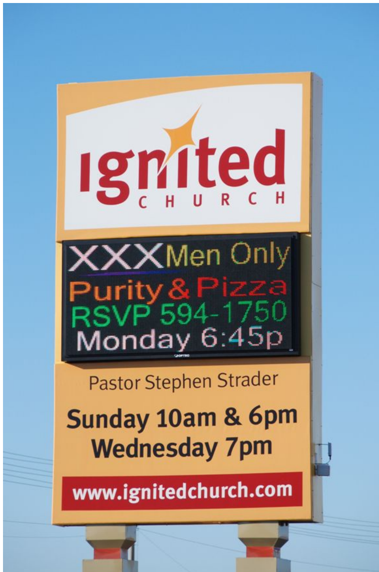
Bro. Cloud caught this photo of a triple-xxx rated church in Florida on a recent trip to the US.