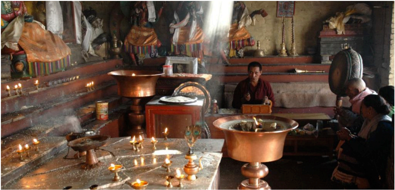
Contemplative prayer being practiced by Buddhists in Nepal

Everywhere we look evangelicals are turning to Roman Catholic styles of contemplative spirituality (which in most cases were borrowed from pagan sources), such as ritualistic rote prayers, chanting, mindless repetition, meditation, non-thinking centering prayer, the use of prayer beads, the Stations of the Cross, lectio divina , and labyrinths. The cover story for the February 2008 issue of Christianity Today was “The Future Lies in the Past: Why Evangelicals Are Connecting with the Early Church as They Move into the 21st Century.” It describes the “lost secrets of the ancient church” that are being rediscovered by evangelicals. The ancient church in question happens to be Rome. The article observes that many young evangelicals dislike “traditional” Christianity,” which is described as too focused on “being right,” too much into “Bible studies” and “apologetics materials.” Instead, these evangelicals want “a renewed encounter with a God” that goes beyond “doctrinal definitions.” This, of course, is a description of mysticism, which seeks to experience God beyond the boundaries of Scripture. Christianity Today recommends that evangelicals “stop debating” and just “embody Christianity,” towards which end they should “embrace symbols and sacraments” and dialogue with “Catholicism and Orthodoxy”; they should “break out the candles and incense,” pray the “lectio divina,” and learn the Catholic” ascetic disciplines” from “practicing monks