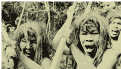
Ted Turner’s vision for the future includes wholesale cannibalism

The following is excerpted from “Turner’s Depopulation Plan,” LifeSiteNews , April 3, 2008: “In a wide-ranging hour-long interview on PBS, CNN founder and billionaire environmental extremist Ted Turner let the cat out of the bag on the real goal of climate change extremists--depopulation. ... Speaking on PBS’s Charlie Rose program on April 1, Turner stated plainly that next to nuclear disarmament the most pressing world concern is ‘global climate change’--which he said is caused by too many people. ... Turner, a fan of China’s one-child policy--despite the brutality of forced abortion and sterilizations which are associated with it--proposed similar limits on family size for all. ‘We’ve got to stabilize population,’ he told Rose. ‘On a voluntary basis, everybody in the world’s got to pledge to themselves that one or two children is it.’ ... Turner and environmentalist extremists of his ilk employ cultish fear-mongering in order to promote their religious