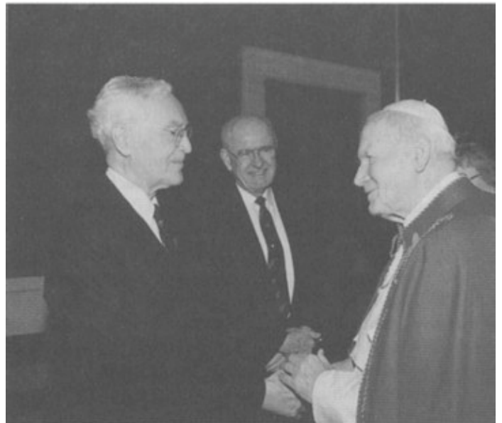
An audience with Pope John Paul II

Bruce Metzger with Pope John Paul II. Metzger was associated with the American Bible Society for more than 50 years and was a Trustee Emeritus at his death last year.