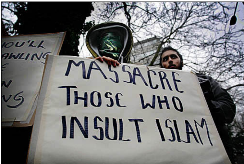
Photo taken at a London pro-Islamic protest.

Alum Rock Road in February when they started talking to four Asian youths. A police community support officer (PCSO) interrupted the conversation and began questioning the ministers about their beliefs. 'He said we were in a Muslim area and were not allowed to spread our Christian message. He said we were committing a hate crime by telling the youths to leave Islam and said that he was going to take us to the police station.' ... The ministers claim he also advised them not to return to the area. As he walked away, the PCSO said: 'You have been warned. If you come back here and get beaten up, well, you have been warned.'"