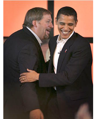
Rick Warren and Barack Obama

7 1 Judge not, that ye be not judged. 2 For with what judgment ye judge, ye shall be judged: and with what measure ye mete, it shall be measured to you again. 3 And why beholdest thou the mote that is in thy brother's eye, but considerest not the beam that is in thine own eye? 4 Or how wilt thou say to thy brother, Let me pull out the mote out of thine eye; and, behold, a beam is in thine own eye? 5 Thou hypocrite, first cast out the beam out of thine own eye; and then shalt thou see clearly to cast out the mote out of thy brother's eye. Matthew 7:1-5