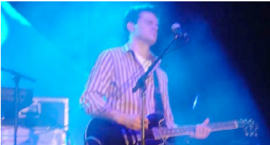
Tennessee Temple University features bands like Big Daddy Weave at student events.

ground of the truth in this dark world (1 Timothy 3:15). By receiving unbelieving men who worship false gods and false christes and false gospels and giving them a forum to voice their opinions, Rick Warren has turned the church into the pillar and ground of confusion, and you can be sure that he will answer to Almighty God for it. Where are all of the "conservative" Southern Baptist preachers who should be lifting their voices against this wickedness? I also want to hear them condemn Billy Graham's ecumenical evangelism, but I won't hold my breath.