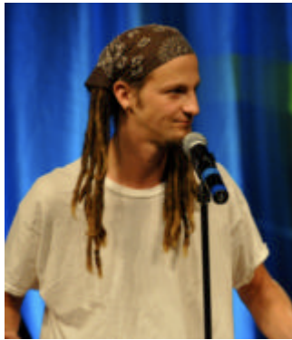
Shane Claiborne (see bio, next page)